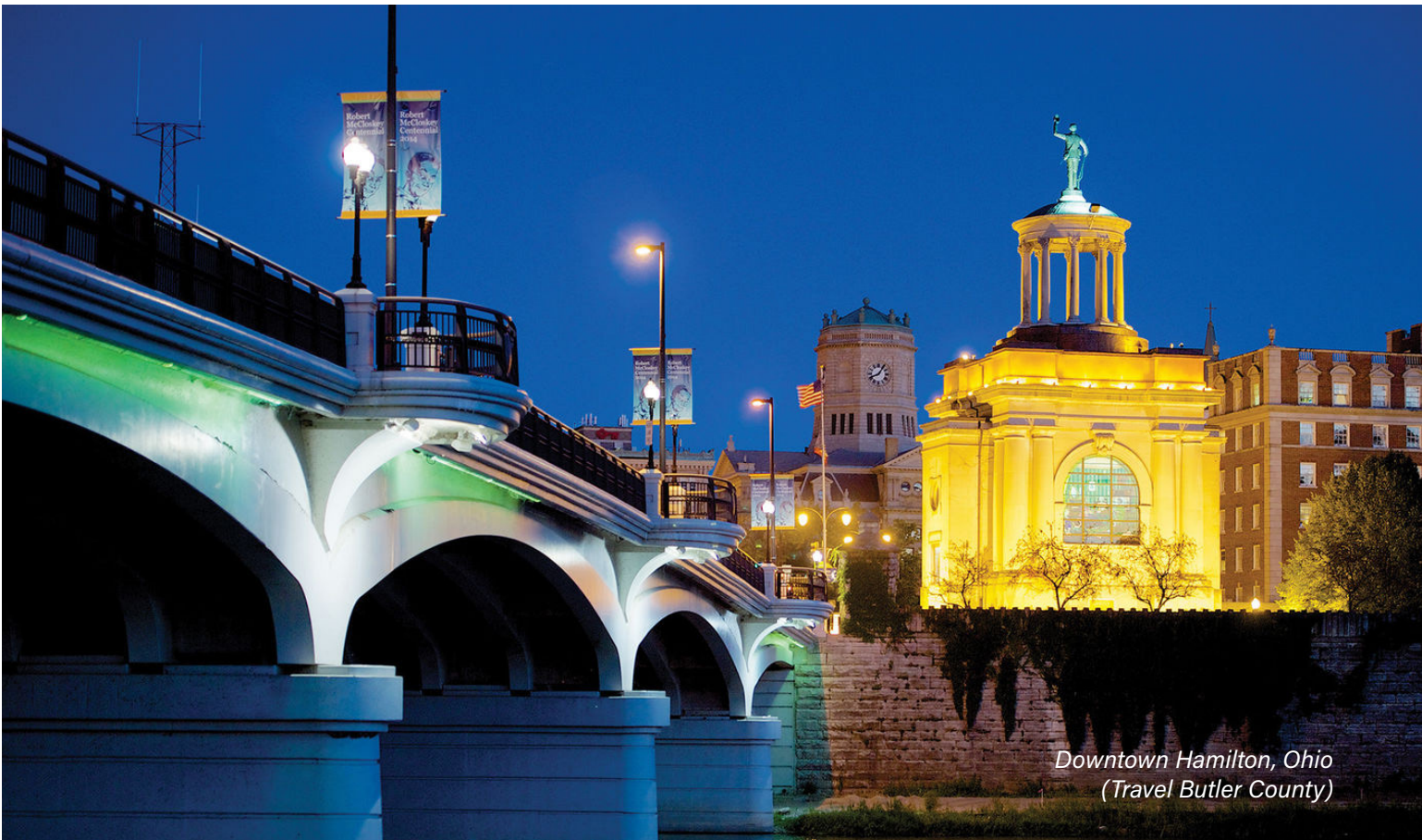
Downtown Hamilton, Ohio