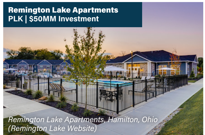
Remington Lake Apartments, Hamilton, Ohio