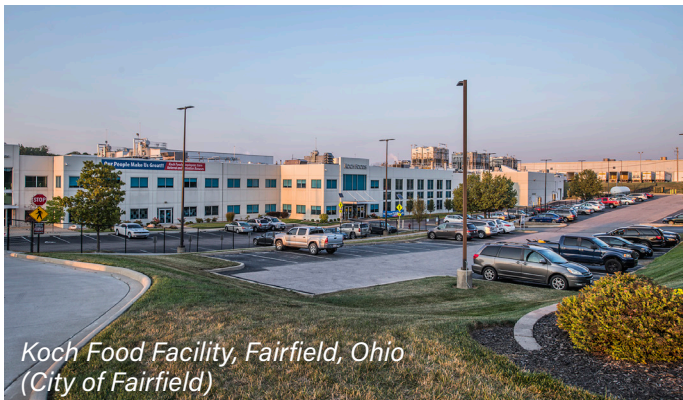
Koch Food Facility, Fairfield, Ohio

BCFA supported the expansion of the Koch Foods Plant B facility in Fairfield, representing a transformative $103 million investment in Butler County's manufacturing infrastructure. The project will create 578 new jobs and generate $24.6 million in annual payroll, reinforcing Fairfield's position as a major hub for food processing and advanced manufacturing while strengthening opportunities for the regional workforce.