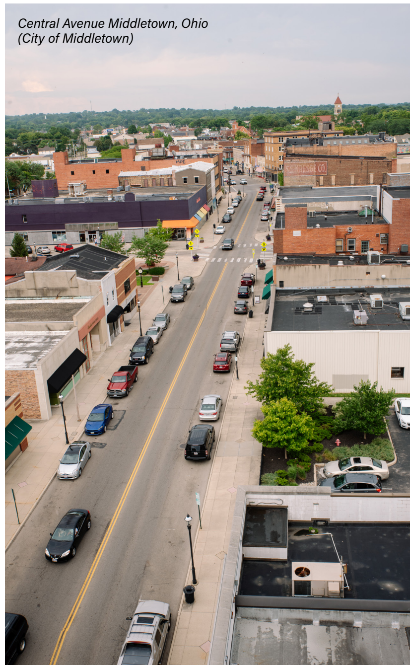
Central Avenue Middletown, Ohio (City of Middletown)