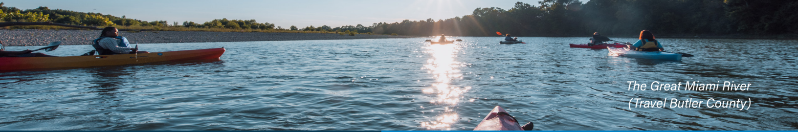
The Great Miami River

As BCFA enters 2026, it will build on recent momentum to drive job creation, attract private investment, and advance redevelopment across Butler County. With stronger partnerships and expanded financial tools in place, the focus now turns to deploying these assets to accelerate growth countywide.