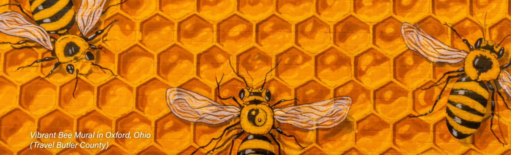
Vibrant Bee Mural in Oxford, Ohio