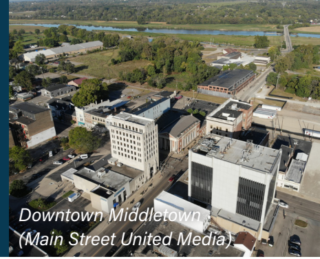
Downtown Middletown

In 2025, the Butler County Finance Authority expanded its development finance platform through new capital tools, partnerships, and investments that support private investment and redevelopment across Butler County.