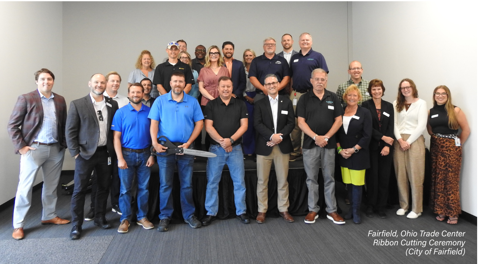
Fairfield, Ohio Trade Center Ribbon Cutting Ceremony (City of Fairfield)

We recognize municipal leaders, schools, workforce institutions, chambers of commerce, private organizations, and community stakeholders whose collaboration strengthens Butler County's future.