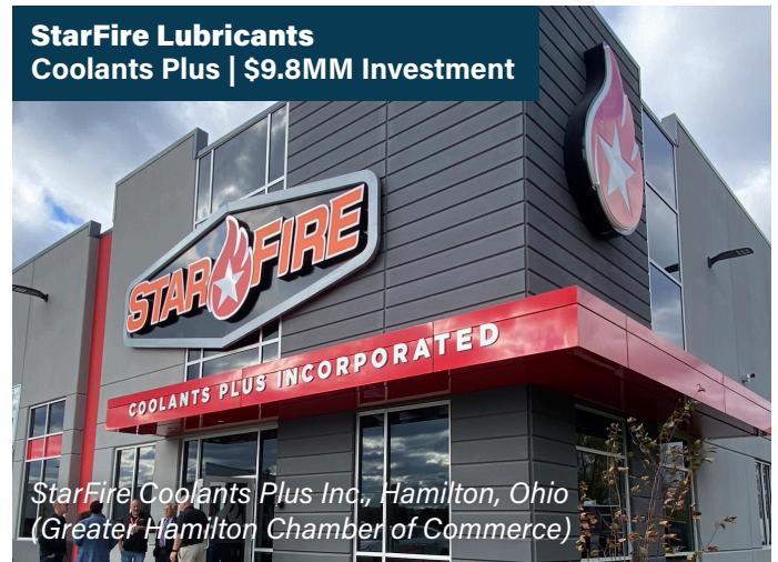
StarFire Coolants Plus Inc., Hamilton, Ohio (Greater Hamilton Chamber of Commerce)