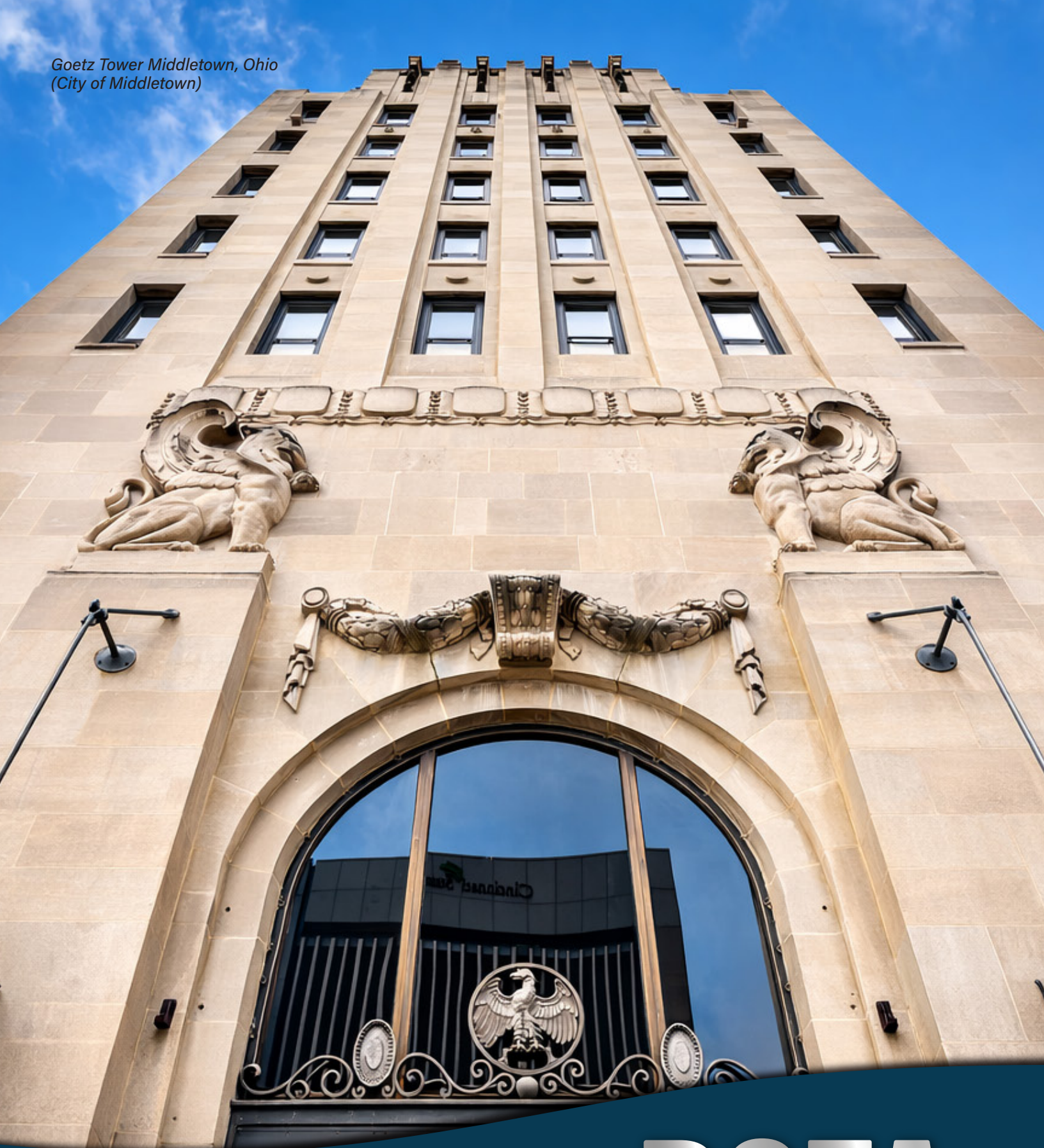
Goetz Tower Middletown, Ohio

FOR MORE INFORMATION Please visit theBCFA.org .